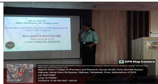
Student Feedback on Seminar