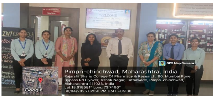
Team Knleo Cosmetics Pvt. Ltd., Pune and RSCOPR