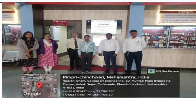
Team Neon Laboratories, Ltd. Pune and RSCOPR