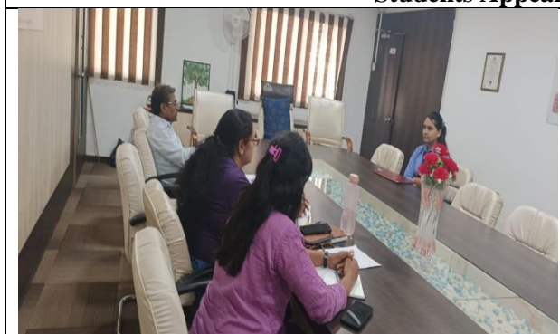
Students Appearing for Mock Interview