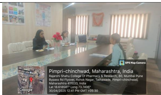
Personal Interview Round