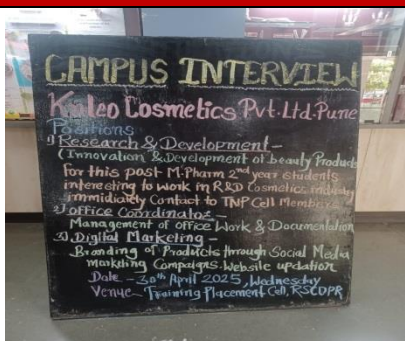
Campus Interview of Knleo Cosmetics Pvt. Ltd., Pune