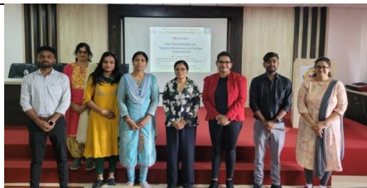
Resource persons from Canam Study Abroad Consultancy, Pune and Study Smart Overseas Education Consultancy, Pune along with T&P members of RSCOPR.