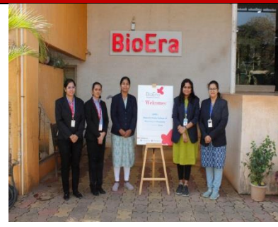
BioEra LifeSciences Pvt. Ltd., Pune, Team and JSPM's RSCOPR participants