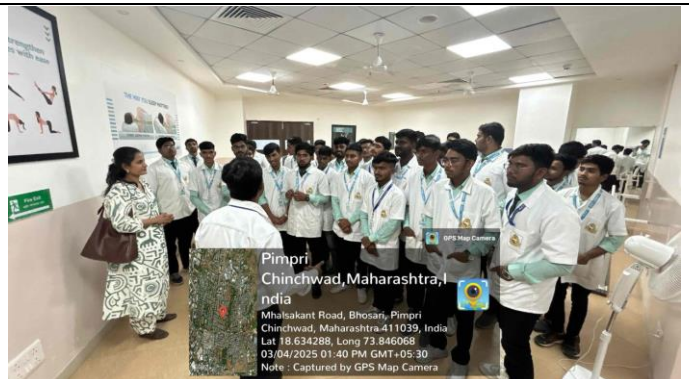
Industrial visit at Medcover Hospital, Bhosari