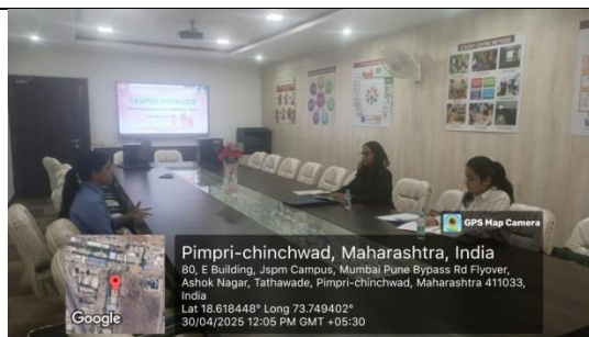
Personal Interview Round