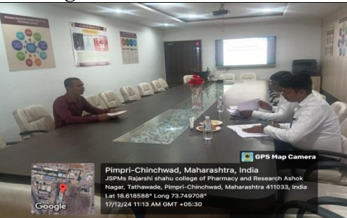
Personal Interview Round