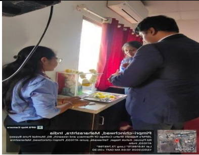
Inauguration of One Day seminar