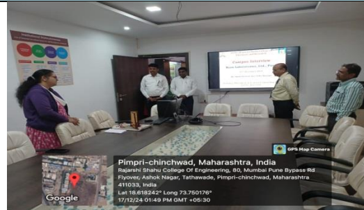
Formal Introduction of Guests