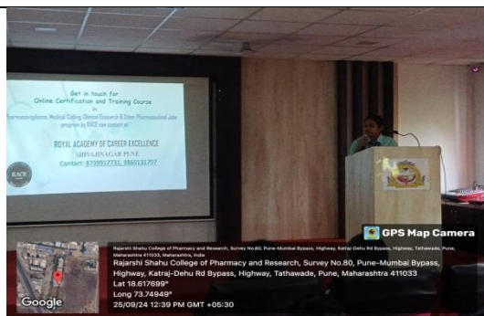
Student Feedback on Seminar