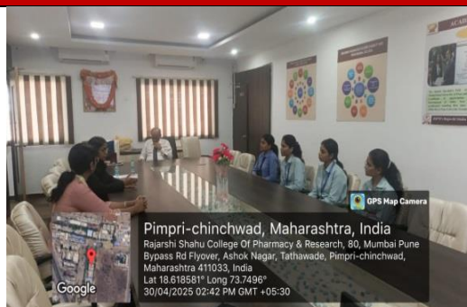
Pre-placement Talk of Company director