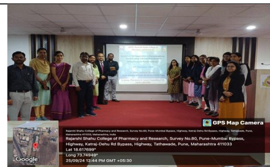
RSCOPR Team with RACE members