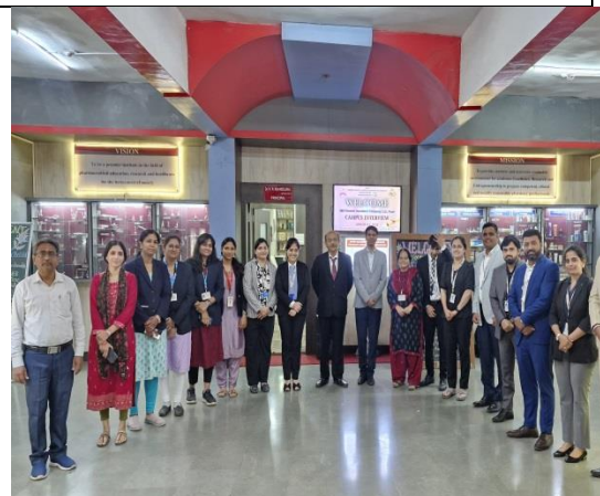
Selected students(Tathawade, Wagholi Campus) along with TNP Cell and SBI GIC team