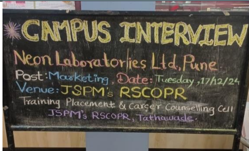
Campus Interview of Neon Laboratories. Ltd. Pune.