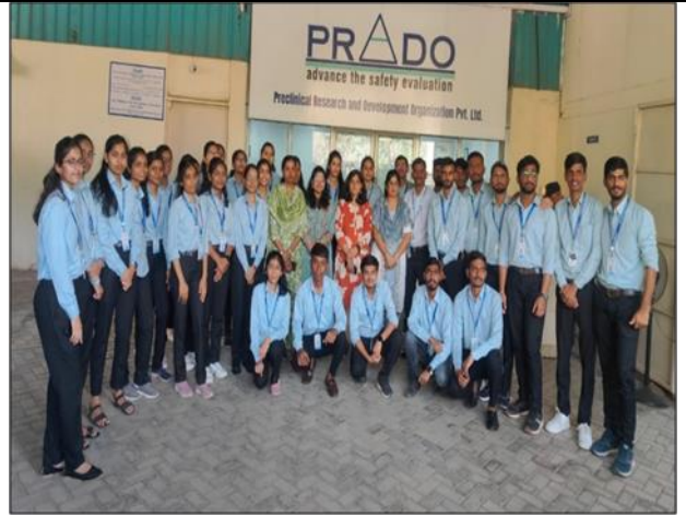
RSCOPR students, Faculty and PRADO Team members