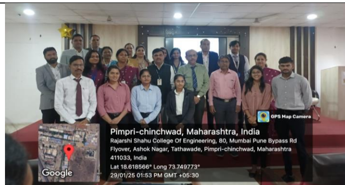
Selected students(Tathawade, Hadapsar & Wagholi Campus) along with TNP Cell and SBI GIC team